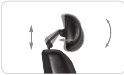
3D Headrest Height adjustable, rotatable and depth adjustable