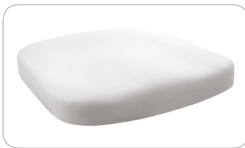
Molder foam ±50° High density molder foam (including headrst,chair back,chair seat)