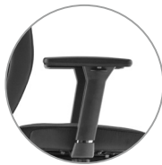
4D armrest GP311H-4D-MB