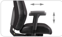
4D armrest Four dimensions