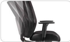
Back tilt Four positions lock