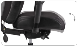
Seat front tilt Enable forward pelvic rotation standing hip abduction to help long-time work without numbness