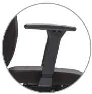
3D armrest GP311H-3D-MB