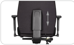
Back ratchet Height adjustment