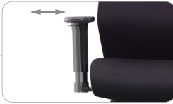
Arm width Width adjustment