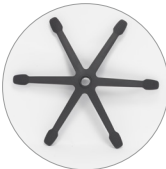
1 Six legs nylon base R-355mm,passed BIFMA standard