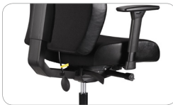
Air Lumbar Design Add or subtract the air to make a suitable lumbar support with pump on right side.