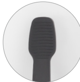
2 Ergonomic foot-grip design base

Heavy duty chair designed for intensive office use and 24 hour shifts. It can be adjusted to the stature of most people to facilitate the sharing of the chair between employees on different working shifts. This chair is made for users up to 400 lbs and it has 5 years warranty.